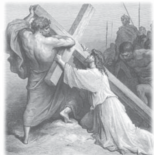
"Christ also hath once suffered for sins, the just for the unjust, that he might bring us to God..." 1 Pet. 3:18

world will choose life everlasting when they finally see for the first time , with eyes unhindered by false doctrines, the beautiful harmony of the Scriptures.